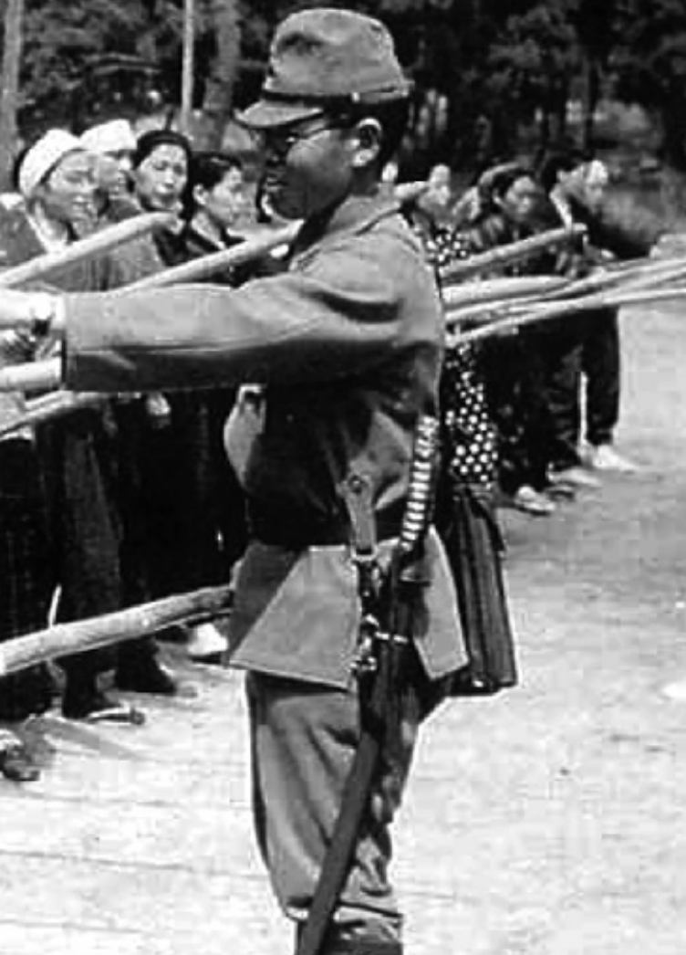
Imperial Japanese Army

A Japanese soldier trains women to defend the homeland with bamboo spears in 1945. Bushido, or "the way of the warrior," was a code deeply ingrained not only in the military but also in Japan's citizenry.