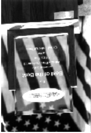
SMSGt. Alford 'Best of Best'