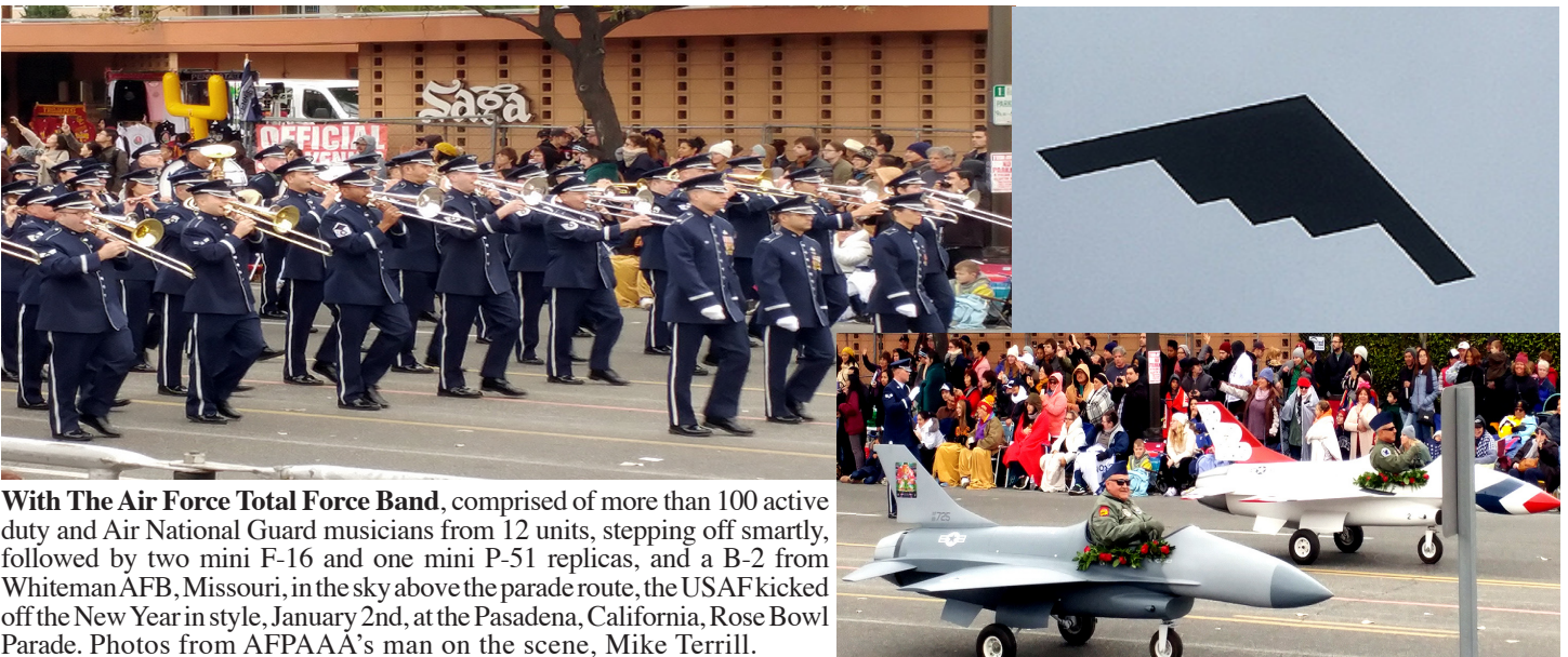
With The Air Force Total Force Band, comprised of more than 100 active duty and Air National Guard musicians from 12 units, stepping off smartly, followed by two mini F-16 and one mini P-51 replicas, and a B-2 from Whiteman AFB, Missouri, in the sky above the parade route, the USAF kicked off the New Year in style, January 2nd, at the Pasadena, California, Rose Bowl Parade.