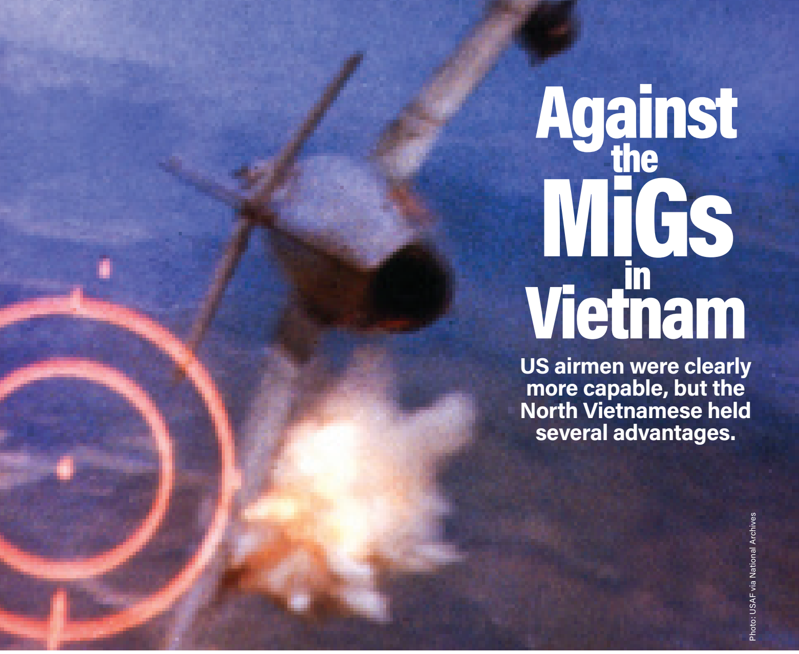
A North Vietnamese MiG-17 is hit by 20 mm rounds from an Air Force F-105D on June 3, 1967.