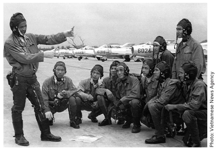
North Vietnamese pilots are briefed on dogfighting tactics in front of Chinese-made MiG-19s. These aircraft arrived late in the war, were less maneuverable than the MiG-17, and slower than the MiG-21.

Several factors contributed to the difference. Navy airmen, flying off carriers in the Tonkin Gulf, entered Vietnam with their backs to the sea and the MiG threat in front of them.