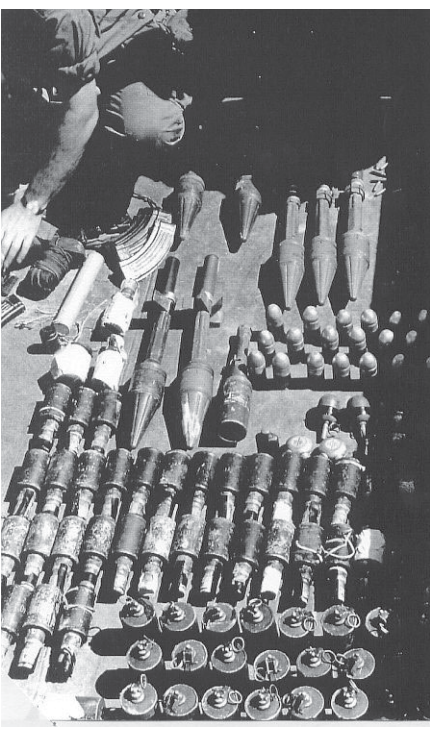
A portion of the explosives removed by explosives ordnance disposal personnel from dead, wounded or captured Viet Cong during an attack on Tan Son Nhut Air Base. Include are Rocket Propelled Grenades, U.S. 40mm projectiles, and numerous home-made hand grenades.

Throughout the rest of the night, there were several false alarms regard-