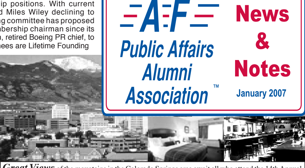
Great Views of the mountains in the Colorado Springs area await all who attend the 14th Annual Membership Meeting, May 3-5, at the Antlers Hilton Hotel, which provides comfy accommodations and a convivial spot to sip an appropriate libration while catching up on things with old friends.

The newly elected board members will begin their twoyear terms on July 1.